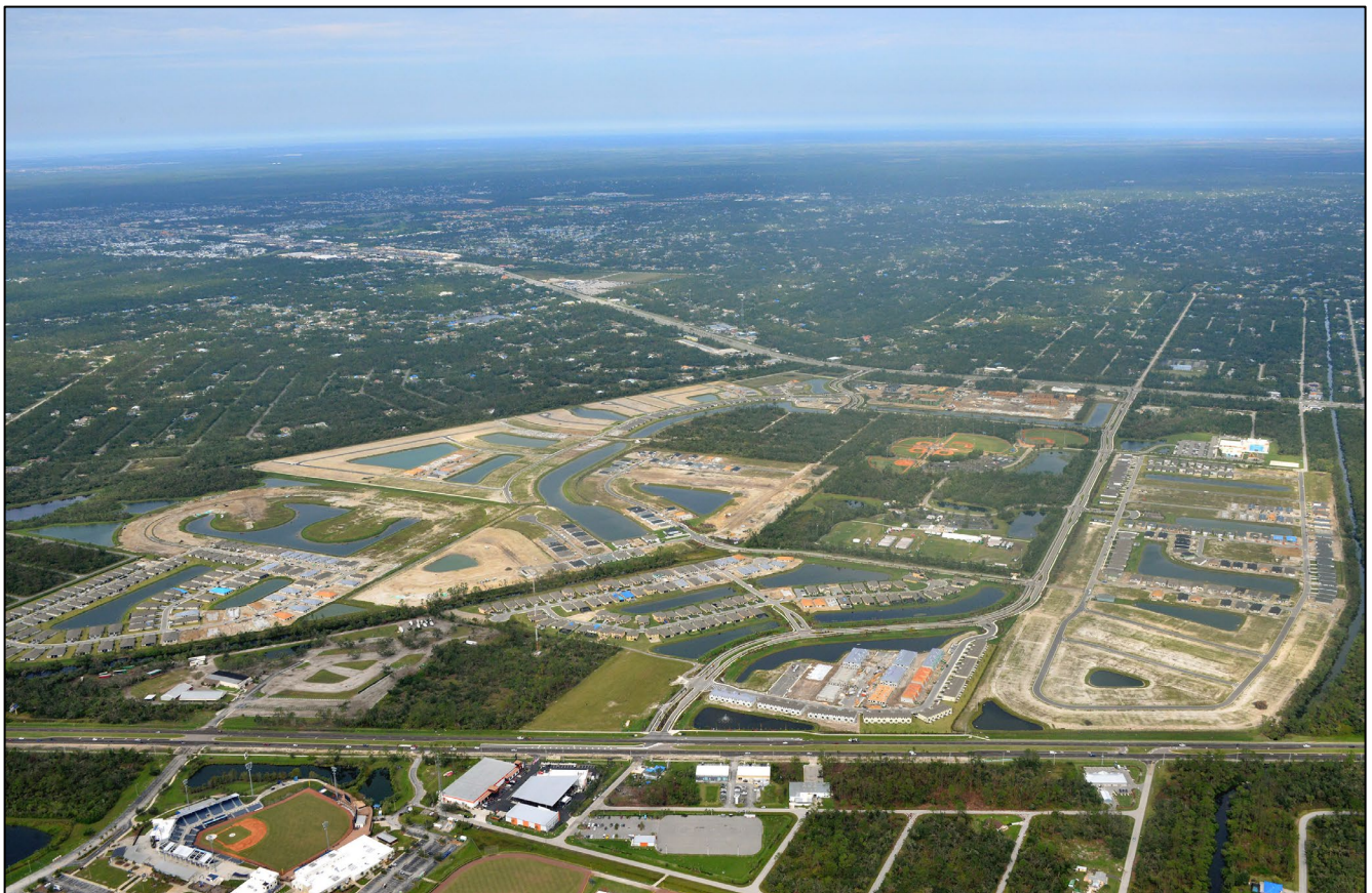
Figure 3 - West Port Phase I Progress, November 2022

West Port: As previously stated, Kolter Land Partners LLC continues with development and land sales within the West Port community and is working closely with County staff to complete infrastructure improvements residential subdivisions. With Kolter's future expansion of West Port into the center portion of Murdock Village (Phase II) and a vehicular bridge across the Flamingo Waterway, there will be improved connectivity between the west and center sections of Murdock Village. Development of Phase II will include multi-use pathways to improve pedestrian and bicycle mobility, a small area of commercial development for a variety of uses, as well as the potential for a medical office facility to service the surrounding area. Figures 5 and 6 below help illustrate the size and significance of this development and its impact on the Murdock Village CRA. It is expected that Kolter and the CRA will close the purchase and sale of the property for Phase II in early 2024.