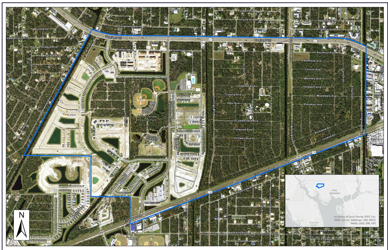
Figure 1 - 2023 Aerial Map of Murdock Village with CRA Boundaries

On May 27, 2003, the Charlotte County Board of County Commissioners adopted Resolution No. 2003-081 which created the Murdock Village Community Redevelopment Agency (CRA) and declared that the Board shall also sit ex-officio as the Agency. Currently the Agency is actively engaged with developers to design and develop areas within Murdock Village to meet regional market requirements and create an area with a mix of distinct neighborhoods of housing, attractions, and employment.