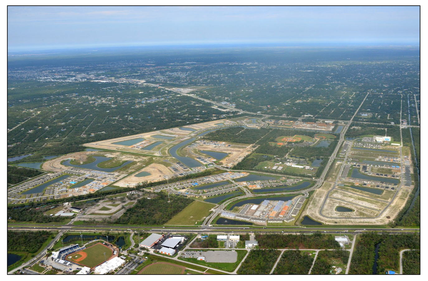
Figure 3 - West Port Phase I Progress, November 2022

West Port: As previously stated, Kolter Land Partners LLC continues with development and land sales within the West Port community and is working closely with County staff to complete infrastructure improvements residential subdivisions. With Kolter's future expansion of West Port into the center portion of Murdock Village (Phase II) and a vehicular bridge across the Flamingo Waterway, there will be improved connectivity between the west and center sections of Murdock Village. Development of Phase II will include multi-use pathways to improve pedestrian and bicycle mobility, a small area of commercial development for a variety of uses, as well as the potential for a medical office facility to service the surrounding area. Figures 5 and 6 below help illustrate the size and significance of this development and its impact on the Murdock Village CRA.