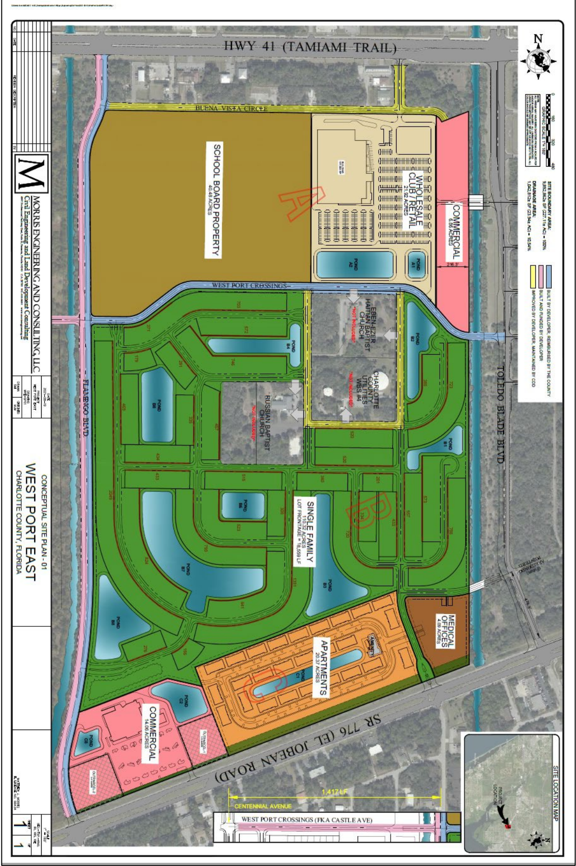
Figure 4 - West Port Phase II Concept Plan