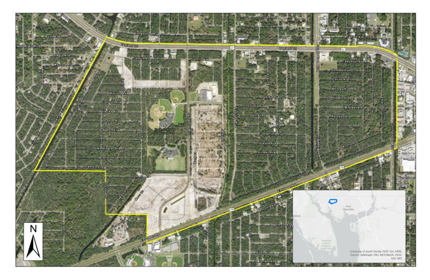
Figure 1 - Aerial Map of Murdock Village with CRA Boundaries

On May 27, 2003, the Charlotte County Board of County Commissioners adopted Resolution No. 2003-081 which created the Murdock Village Community Redevelopment Agency (CRA) and declared that the Board shall also sit ex-officio as the Agency. Currently the Agency is actively engaged with developers to design and develop areas within Murdock Village to meet regional market requirements and create an area with a mix of distinct neighborhoods of housing, attractions, and employment.