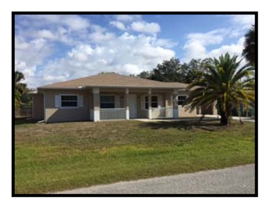
Residential Investments are Improving the housing stock.

In 2012 the Board of County Commissioners approved a $9,000,000 loan to the Parkside CRA to initiate redevelopment projects to help encourage private investment. Examples of the private sector investing in the community are the Parkside Memory Cottage and the new 7-11 which worked with Team Parkside to design a facility to meet the goals of the community. Fawcett Memorial Hospital is schedule to begin a $30 million expansion project in 2017.