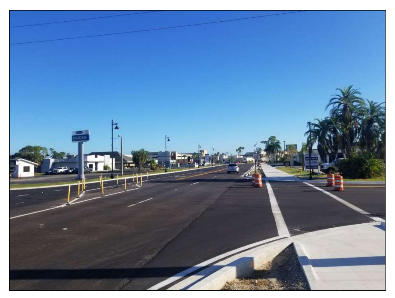
Figure 2 - Olean Boulevard Improvements

Parkside has seen some exciting things happen in during the FY2020-21 period. Improvements at Olean Boulevard continue with Gianetti Construction as the General Contractor. This project is to widen Olean Boulevard from US-41 to Easy Street. This design is a five-lane section with two travel lanes in each direction and a continuous center left/right turn lane in the middle. The design also includes a sidewalk on both sides of Olean Boulevard from Aaron Street to Easy Street, LED decorative lighting, and new traffic signal systems with pedestrian crossings at Aaron Street and Harbor Boulevard. This project will also include multiuse paths and utility expansions on Aaron Street and Gertrude Avenue with LED decorative lighting. Anticipated completion of these projects is May 2022.