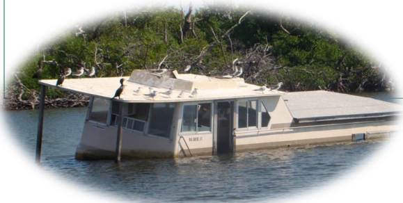
Sunken Houseboat behind Cayo Pelau

West Coast Inland Navigational District (941) 485-9402