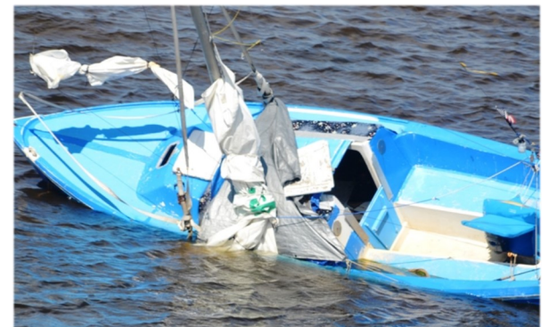
Abandoned sailboat in Charlotte Harbor

Click on 82050 form. Both the Seller and Buyer must sign the form. The seller must then submit the form to the Local Tax Collector's Office and keep a copy for your records.