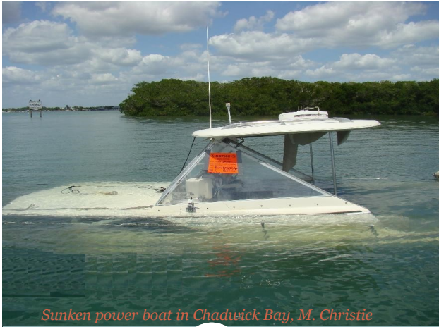
Sunken power boat in Chadwick Bay, M. Christie