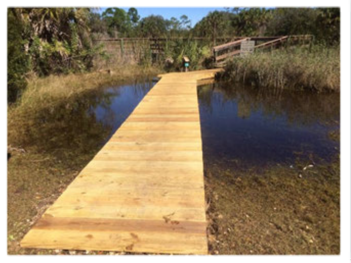
Above: New dock extension