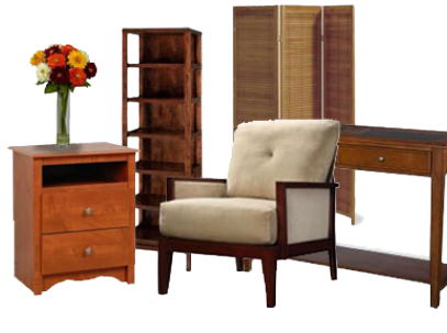
Refuse / Furniture